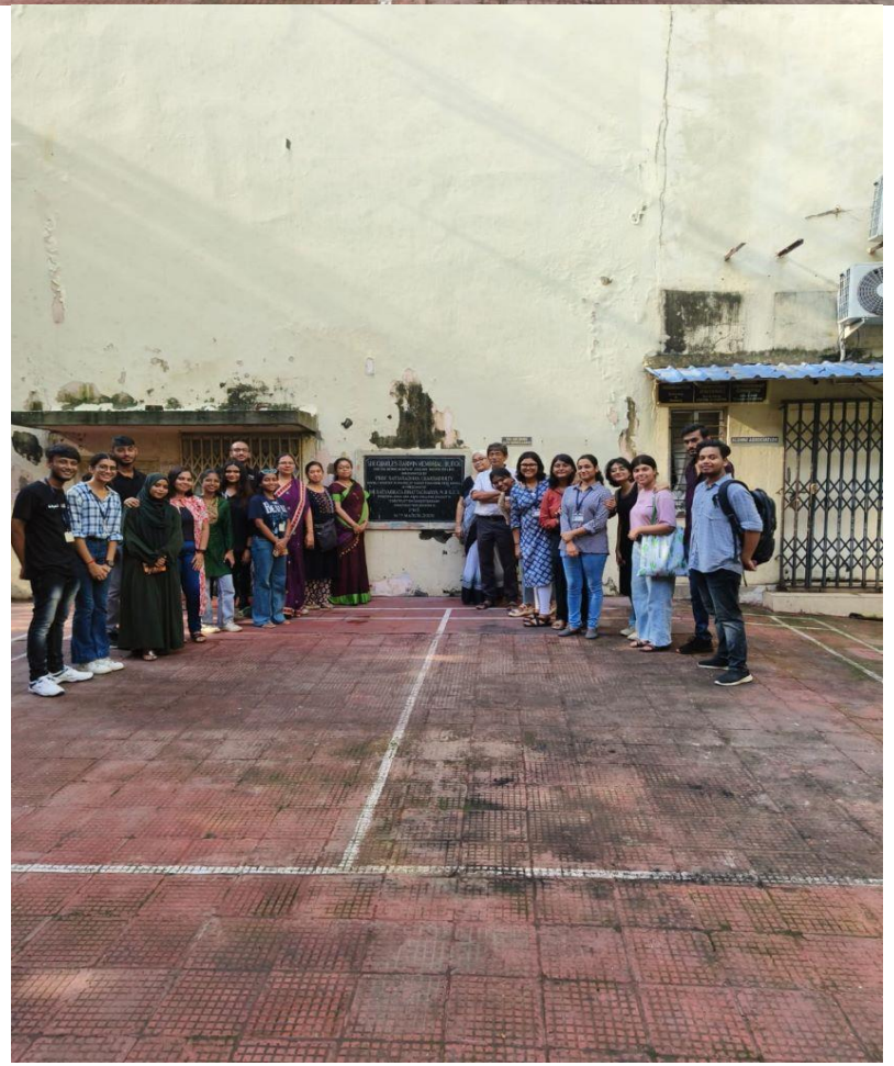
The team of students and teachers